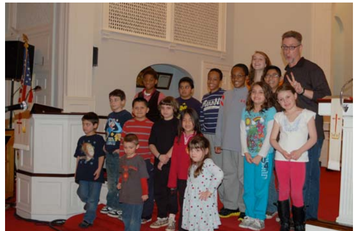
The kids had fun singing and moving with PHREDD!