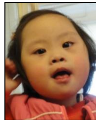
May, 3 Asia