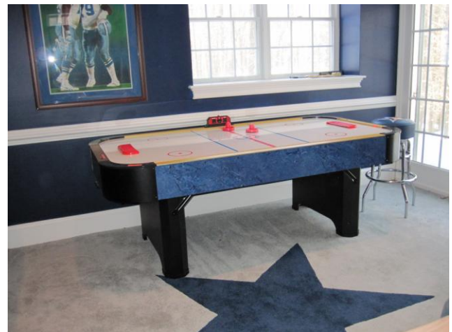
Did you see our "famous" air hockey table in the youth room (pictured above)?

Thank you for your donations on Super Bowl Sunday for the "Souper Bowl of Caring"! We collected approximately 30 cans of soup for the Salvation Army and $163.04 for Safe Harbor. Nationwide there were 8,579 groups that participated and raised $7,502,577 as of February 15. To learn more about this organization, go to their website ( souperbowl.org ). Thanks for making this another successful year in helping those in need!